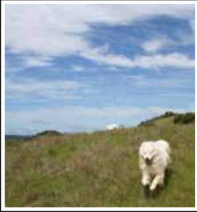
■ Happy Dogs