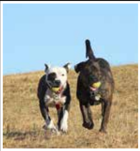
■ Running Free