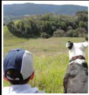
■ Taking A Break